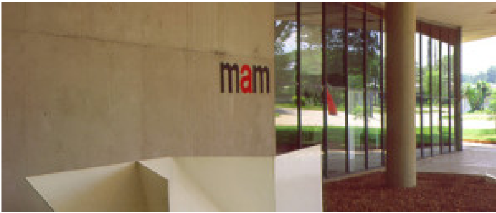
MAM.

The Museum of Contemporary Art (MAC) which is housed in three buildings, exhibits works by Modigliani, Pablo Picasso, Alexander Calder, Tarsila do Amaral, Anita Malfatti, amongst others. New headquarters were added to the buildings in the Ibirapuera Park and the University Campus, located in front of the Ibirapuera Park. The museum is run by São Paulo University (USP) and recently celebrated its 50th anniversary. Besides exhibitions, courses, lectures and other activities are held.