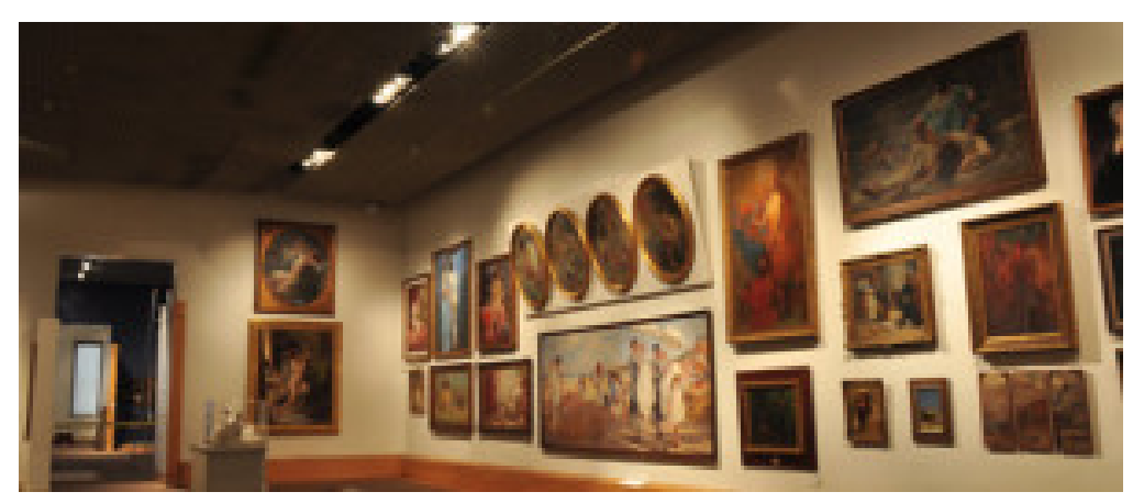
State Painting Collection.

The digitalization at the Portuguese Language Museum is now a classic in São Paulo. There is a lot of interactivity, and visitors can discover much about the language, its history and great names of literature. The technological tools help explain the influence on the language of its peoples and customs, the meaning of words, amongst other subjects. Some educational electronic games, concerning the language, are available.