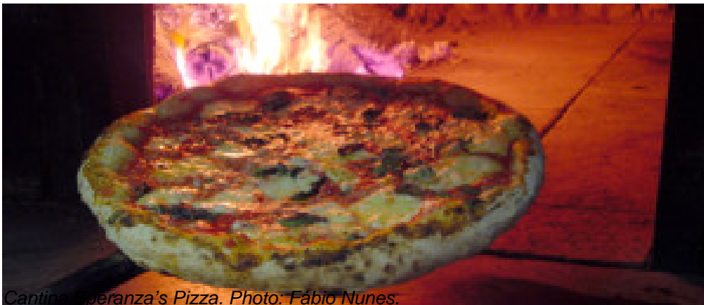
Cantina Speranza's Pizza.