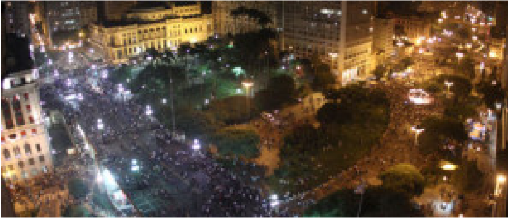
Virada Cultural.

Do you want to know some facts, tips and idiosyncrasies of the city of São Paulo? See the list we have made for you below and have fun!